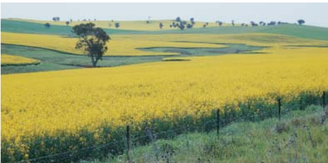
Canola crop with a single tree left marking the riparian zone — in this situation a riparian filter strip could be used to protect the ephemeral stream from any soil lost during crop establishment.

By its very nature, riparian land is fragile, and performs a vital link between land and water ecosystems. Its productivity also makes it vulnerable to over-use and to practices that cause it to deteriorate, creating additional problems. Good management of riparian land is not a substitute for good land management practices elsewhere in a catchment. However, it is an essential component of sustainable management of a property or landscape that can yield numerous benefits.