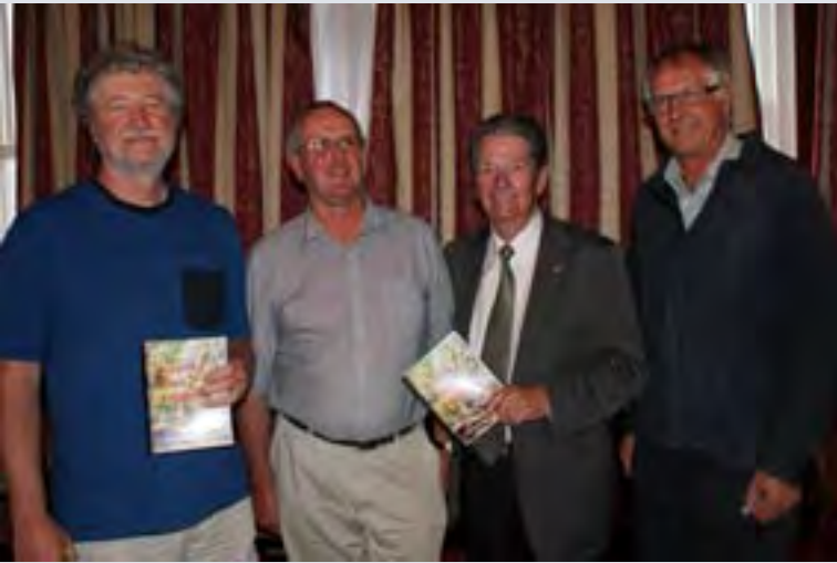
A new publication about the natural resources of the Dorset municipality was launched at Scottsdale in November.

Beasts, Bush and Bugs – A Field Guide for Northeast Tasmania provides useful information about the plants, animals and soils of the Dorset municipality.