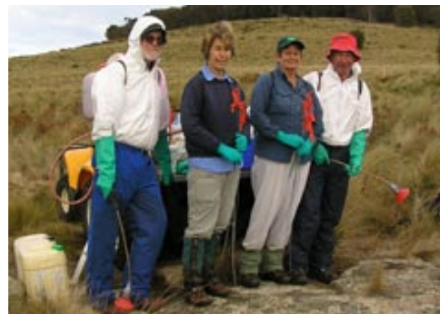
Successful grant applicants - Wildcare Inc. Friends of Deal Island